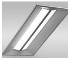
LED Fixture 45 watts