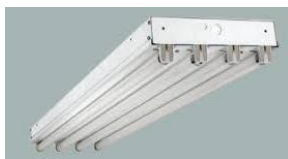
4-Lamp T12 175 watts

For the same amount of light output (lumens), consider the different lighting options: