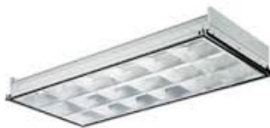
3-Lamp T8 96 watts