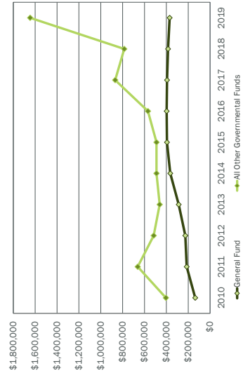
Fund Balances of Governmental Funds

1 In 2011, reporting of fund balances was changed to meet new reporting requirements. For the most part, changes represent removal of purpose of the fund restrictions.